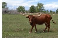
TCR MOONLITE DELITE