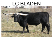
HUNTS MATILDA RESPECT HCR