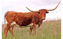
Hunts Respected Dynasty